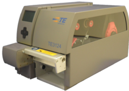
TE3124 fitted with, metal cover and Cutter/Perforator