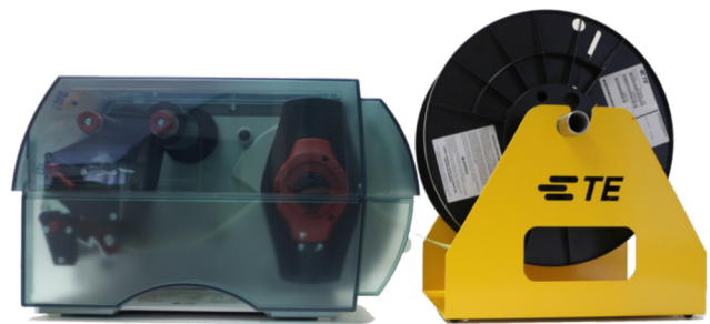
TE3124 with Universal REEL HOLDER